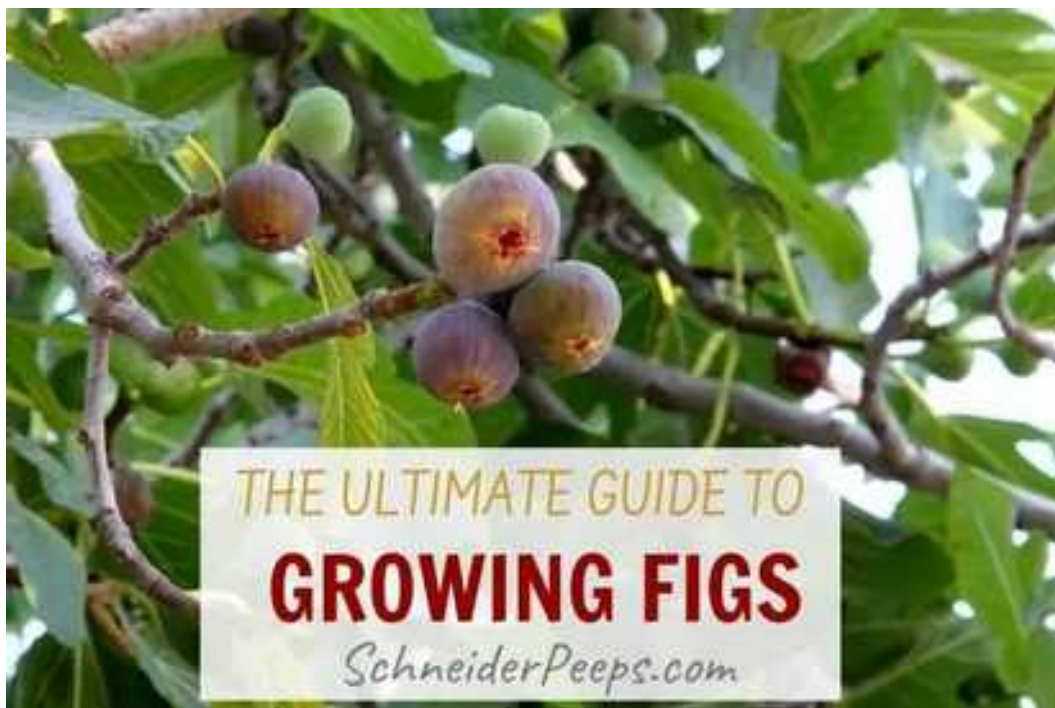
Fig trees ( Ficus carica ) originated in Northwestern Asia and the Middle East. They were brought to the Americas by the Spanish in the sixteenth century.

Because figs don't ship well, it's hard to find fresh figs in the local grocery store. Fortunately, fig trees are easy to grow and care for, making them perfect for growing in the backyard orchard.